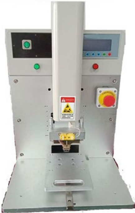
HBS-4AT Can handle PCBs up to 150*150mm